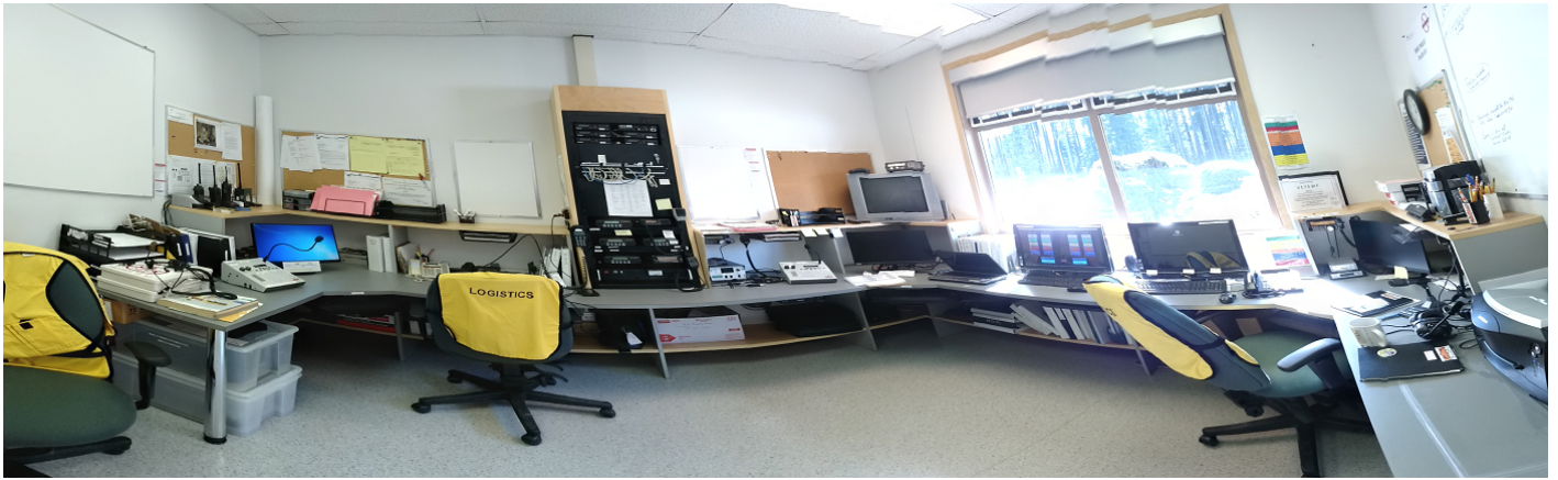
The radio room is pretty limited in size since any work station can be outfitted with a radio terminal.