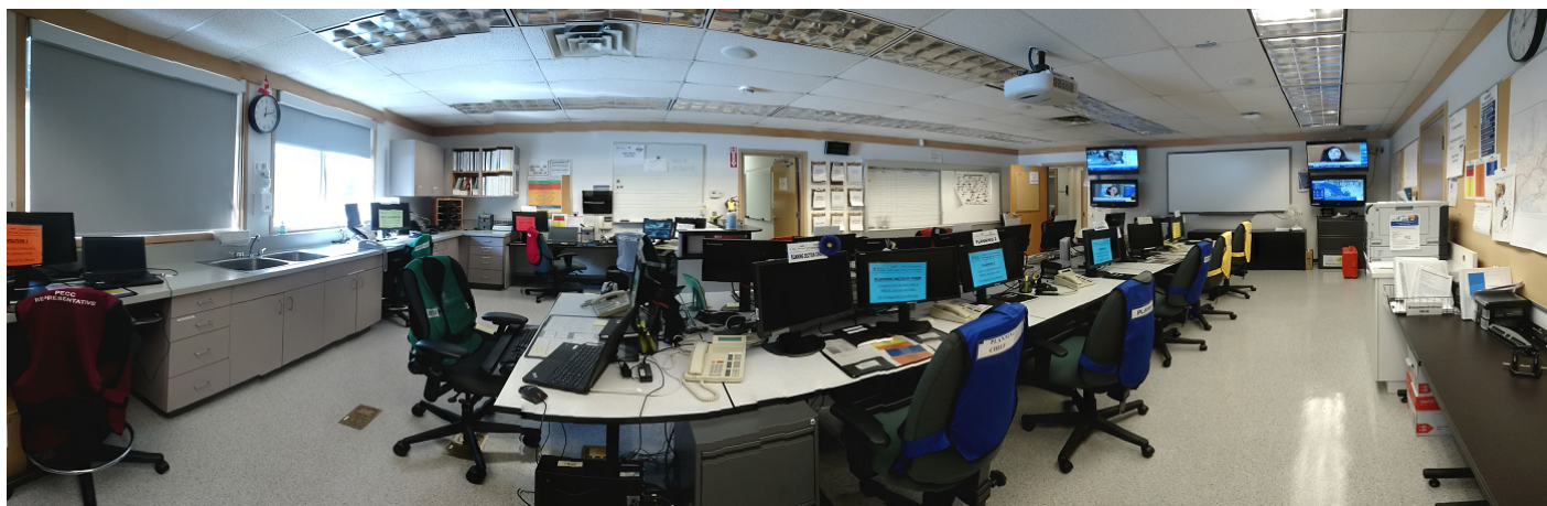
One of the operation's room.