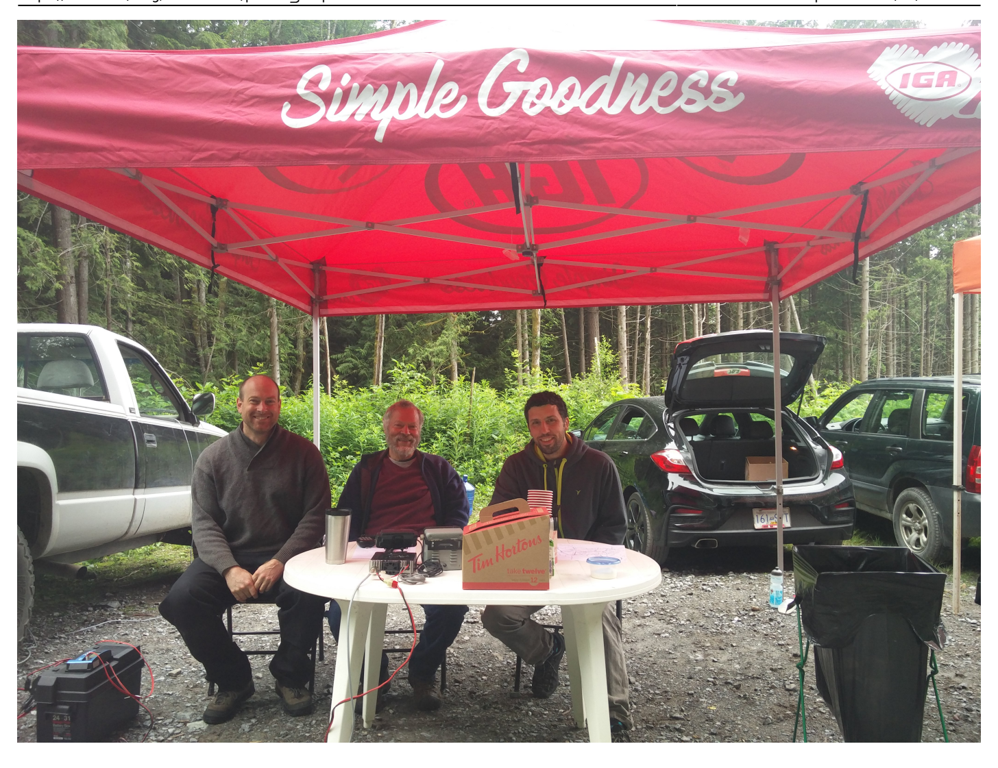
Aid Station 2