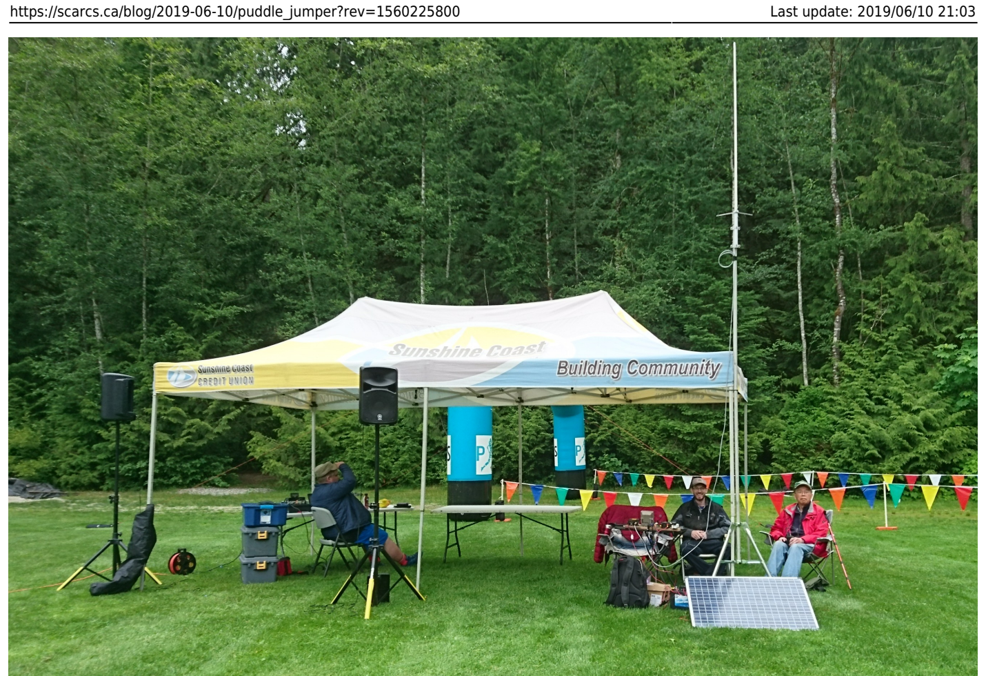
Good thing we brought comfortable chairs and a small table...