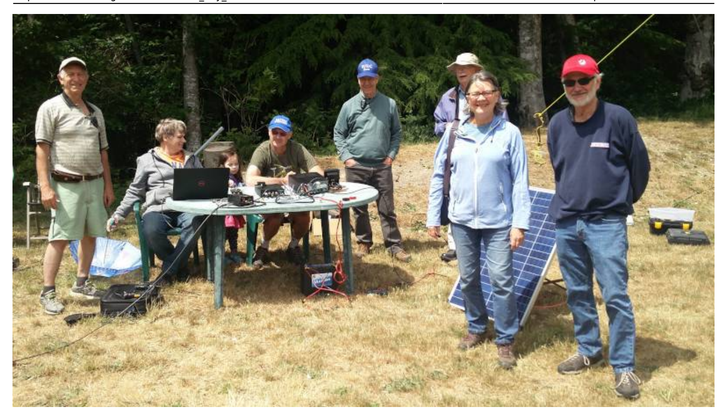
A few people had to leave by 17:00 so we decided to pack up while we had numbers.

It was a fun day. It was fun being out with others and doing radio. We learned some things that will help for next year.