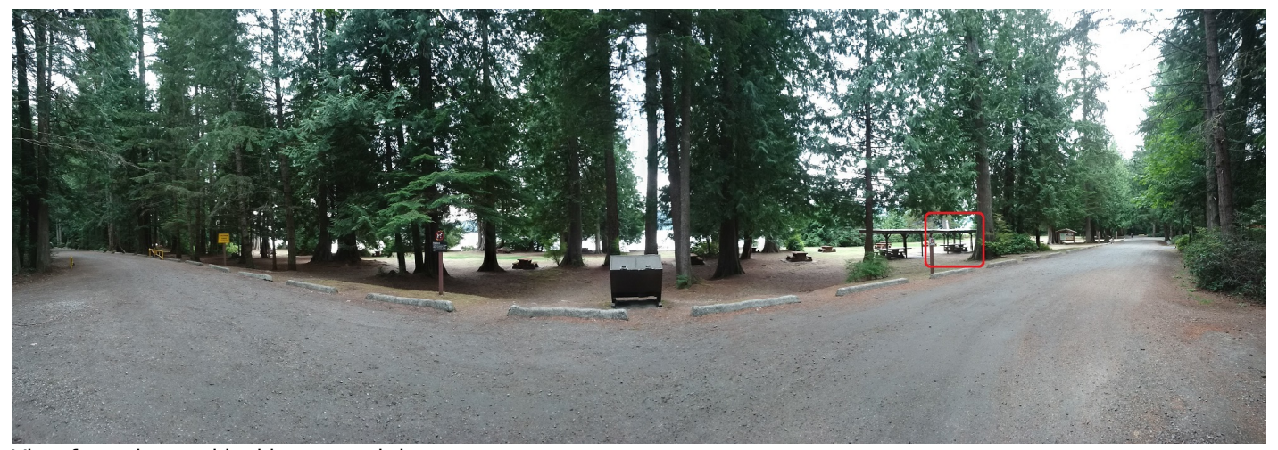
View from the road looking toward the water.