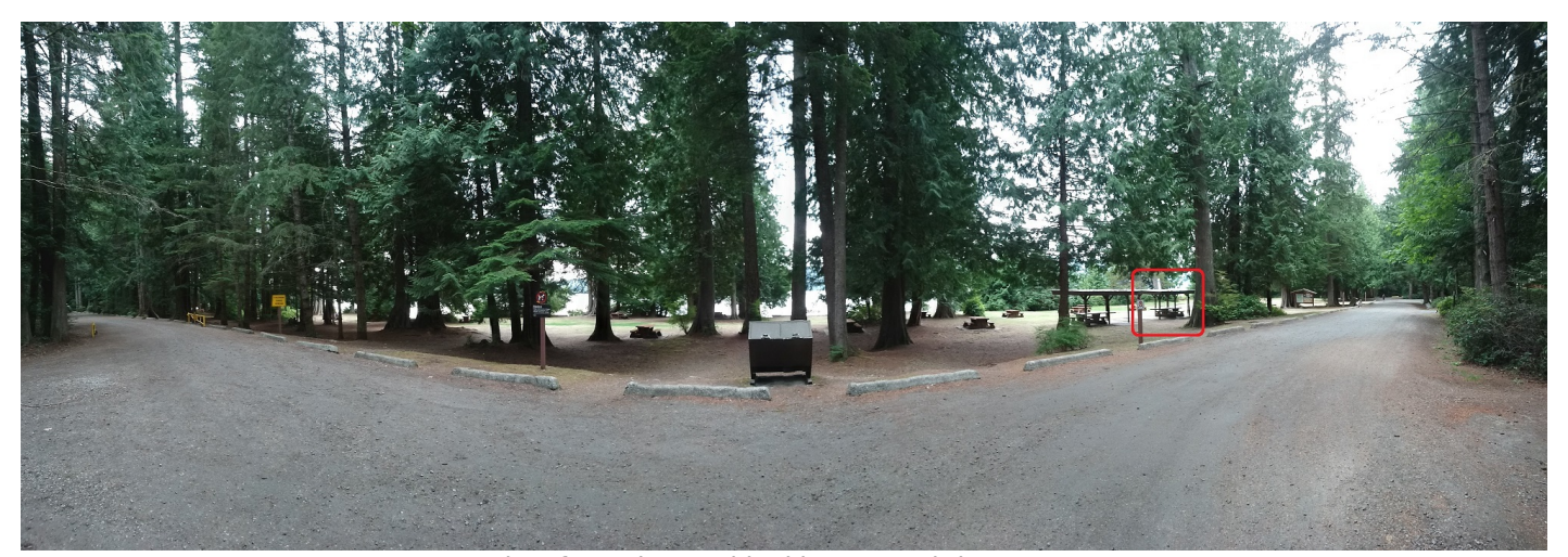
View from the road looking toward the water.

The Park has two covered areas and plenty of trees to hang antennas. One of them is even halfway between two good trees over 20m away on each side (enough room for an 80m dipole!):