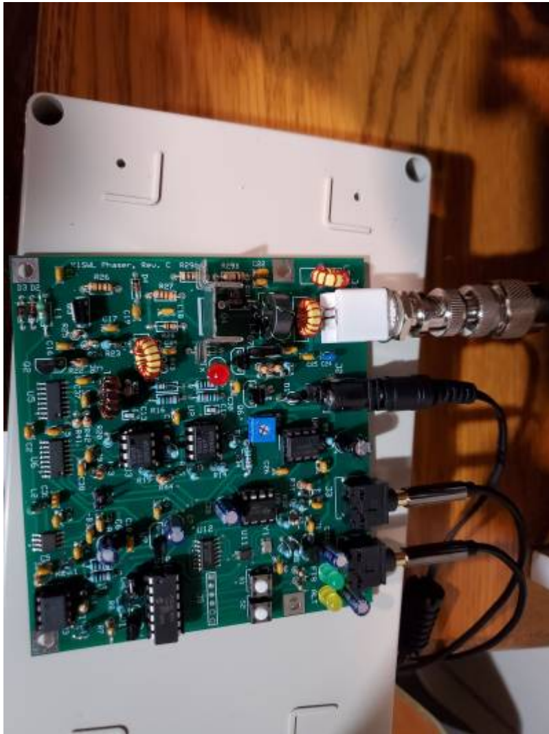
Finished assembly of board.