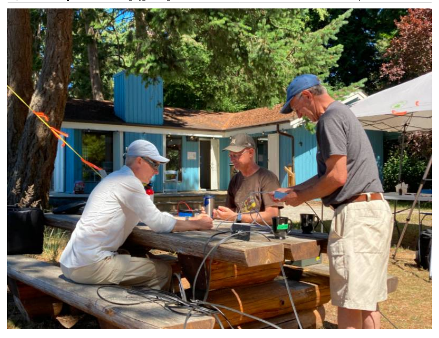
Picnic table operations with Mission House in the background