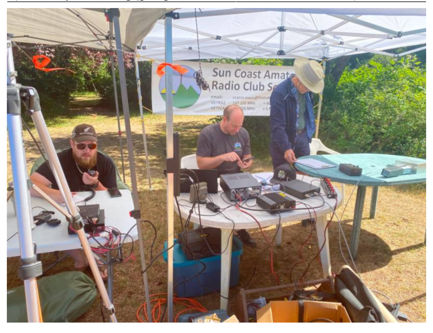
Left-to-right VHF and HF stations...