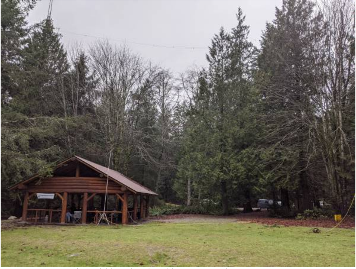
Our Winter Field Day location with 2m/70cm and 20m/40m antennas.